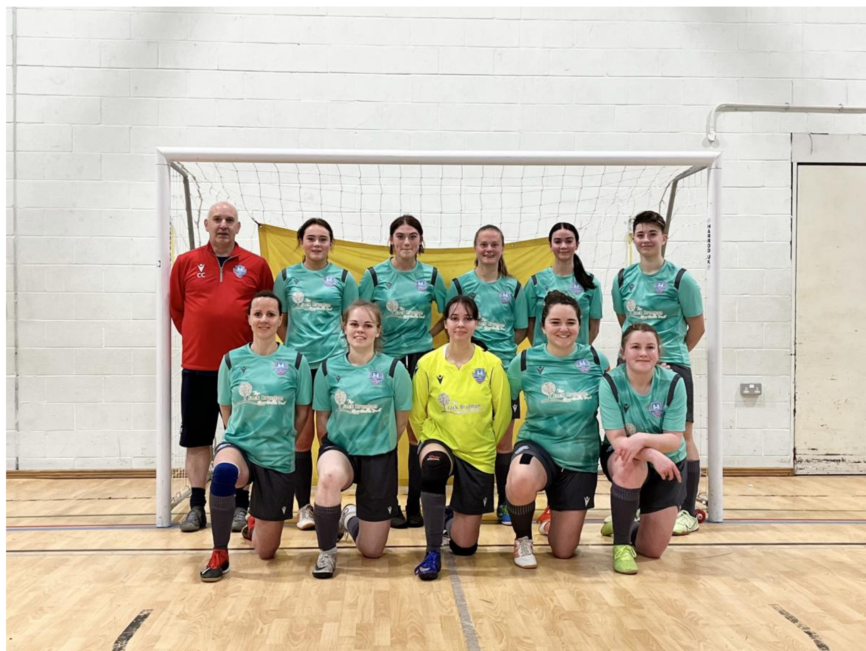
The Bootham Ladies futsal team.